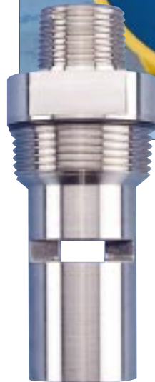
Gas Sensor/Generator Assembly